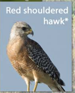
Red shouldered hawk*