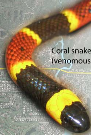
Coral snake (venomous)