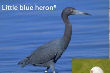
Little blue heron*