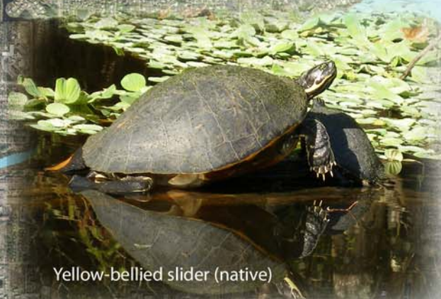
Yellow-bellied slider (native)